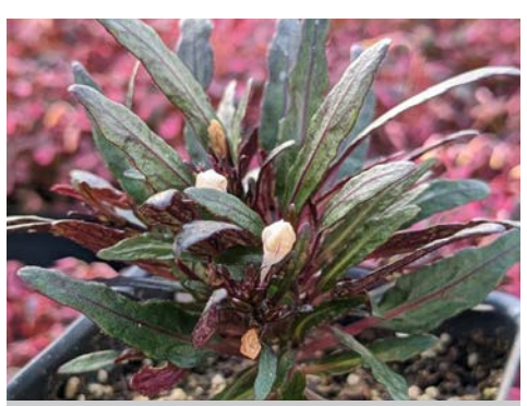
Hemigraphis Dragon Tounge

Tiny bright-variegated green and white leaves with small narrow crimson flowers make this fuchsia unique. Loves shade, good air circulation and steady watering.