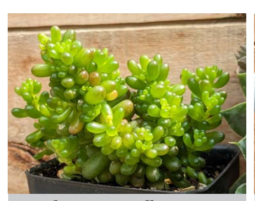
Sedum, Mini Jelly Bean

A rare collector's succulent. A rosette of dark green leaves with soft points at the tips. Small white flowers appear in the fall and early winter that have a sweet scent.