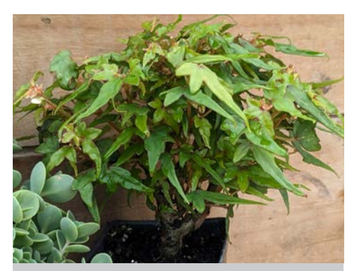
Begonia, Mini Maple Leaf

Botanical: Begonia partita Size: Tree 9" Tall x 9" Wide Flowering Time: Spring-Fall