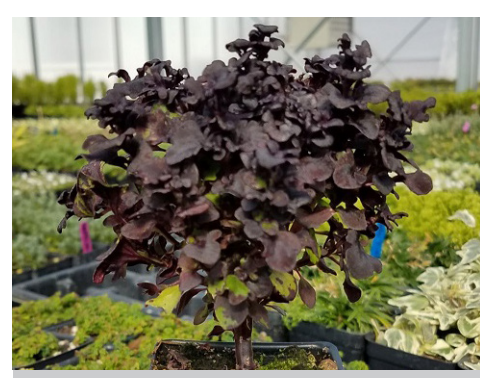
Coleus, Mini Red-Leaf

Attractive tiny narrow leaves remain light green in color with showy fuchsia variegation throughout the year. Forms a thick tree that is drought tolerant and deer resistant.