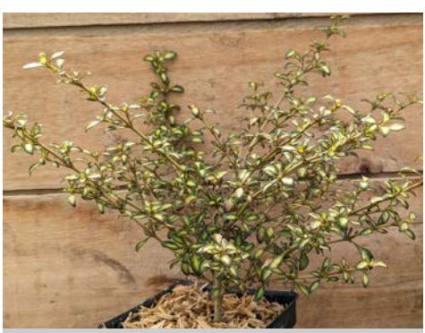
Coprosma, Beatson's Gold

Tiny duckfoot leaves turn deep purple, almost black in full sun. Can be grown in shade or sun. Does well in plantings or in containers.