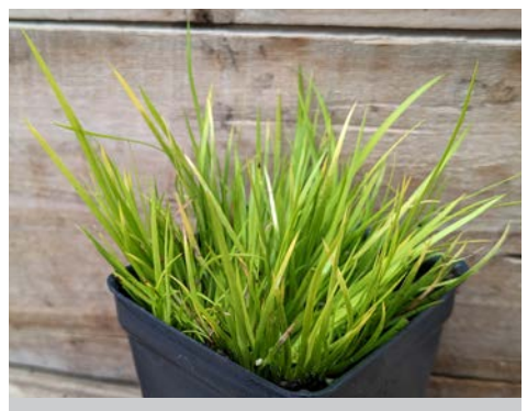
Sweet Flag, Mini Golden

Tolerating morning sun only, this groundcover will show off a carpet of blue flowers from May until Fall. Wonderful around pavers, hanging over a wall or filling in around rocks.