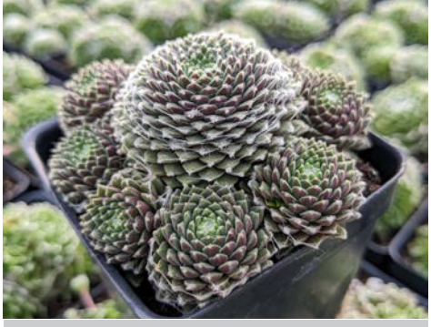
Hen & Chick, Lagger's Mini

Cool, white mini hen and chick rosettes are draped with fuzzy cobwebs. Drought resistant and is perfect in a strawberry jar or succulent garden.