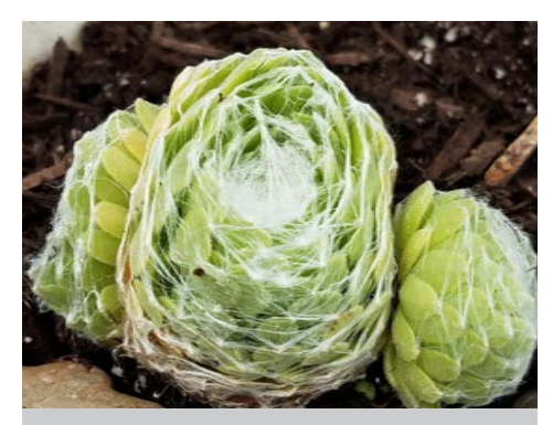
Hen & Chick, Cobweb

Botanical: Sempervirens archnoideum Size: Groundcover 2" Tall x 12" Wide