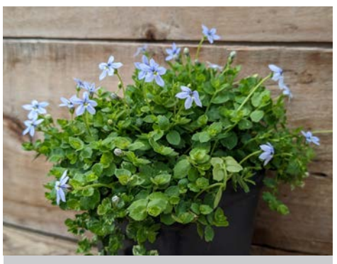
Star Carpet, Baby Blue

White star shaped flowers blanket this groundcover from summer to fall. Will grow more compact and flower more with a little afternoon sun. Water frequently and never allow to dry out when planted in a sunnier location.