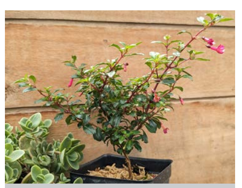
Fuchsia, Lottie Hobby

A free-flowering upright tree with single leaves and small flowers. Flowers are a dainty cerise-red and purple. Prefers morning sun.