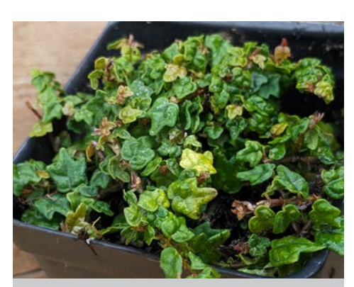
Ficus, Tiny Oak Leaf

The new foliage begins as lime green and matures to a darker green. The petite waxy leaves, constant selfbranching and tolerance of lower humidity makes this tree a favorite.