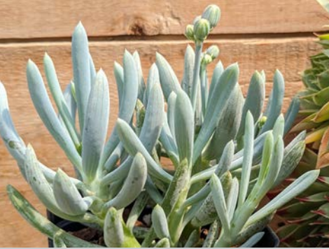
Senecio, Mini Blue Chalksticks

Round, fleshy leaves that spiral up its stems. The color varies from green to red depending on the amount of bright sunlight. An excellent plant that is drought and full sun tolerant.