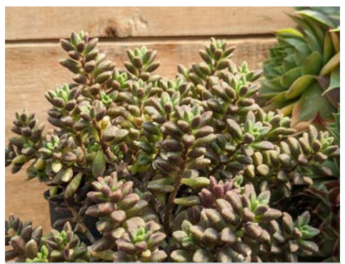
Jade, Tiny Bush

A miniature stacked crassula. Grows best in bright sunlight which helps the leaves show their fine red margins. Will stay small in a pot though it will eventually spill over the edge. Has neat clusters of tiny white flowers.