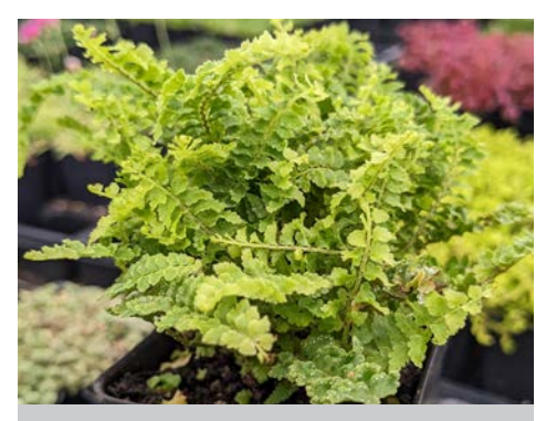
Fern, Smallest Boston

Botanical: Nephrolepis 'Mini Russells' Size: Shrub 2" Tall x 3" Wide