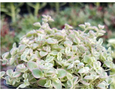
Jade Mini Kitty

Strangely shaped, green flechy leaves grow in every direction. Branches are covered with hairs when young, but smooth bark when mature. Flowers will be white in the summer.