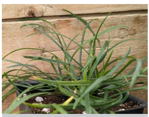
Mondo Grass, White Sparkler

Botanical: Ophiopogon chingii 'Sparkler' Size: Shrub 3" Tall x 4" Wide Flowering Time: Summer