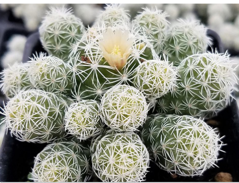
Cactus, White Thimbles

Swollen, tube-like branches grow from upright woody stems. Tiny yellow blooms in the winter will develop into pink berries. Requires little water and light to survive.