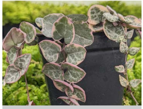
Ceropegia, Var. String of Hearts

Waxy green-striped leaves, washed in cream and pink with burgundy undersides. Its creeping nature and a side show of white flowers makes it a standout in hanging baskets.