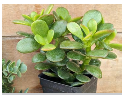
Jade, Baby Tree

Keeping this variety on the dry side encourages a waterfall of ever blooming pink flowers. A cutie for the well drained rock garden.