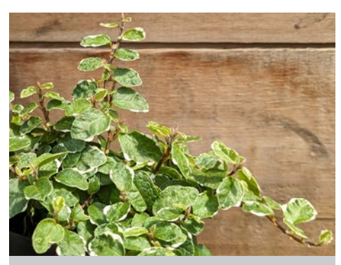
Ficus, Variegated Trailing

Botanical: Ficus pumila 'Variegatus' Size: Groundcover 2" Tall x 12" Wide