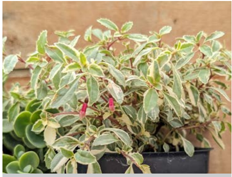
Fuchsia, Var. Lottie Hobby

Fuchsia Lottie Hobby bears small fern-like leaves and tiny flowers on this upright somewhat dwarf shrub. The tubes are cherry red, the sepals red and the single corollas are scarlet.