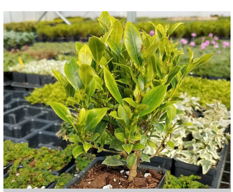
Ficus, Tiny Limey

With long elegant leaves, this ficus is easy to maintain at any height and provides that rare tree element in a landscape.