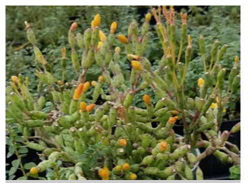
Cactus Spice, Drunkard's Dream

Sharp as a hedgehog and a member of the pineapple or bromelaid family. It is watered very rarely. Forms a small dense mound composed of tiny 1 inch wide rosettes of sharp tipped leaves.