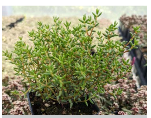
Jade, Fickle Pickles

A fantastic grower whether grown indoors in a container or outside as a tree. When grown in direct sun, the round leaves flush red at the edges. Produces clusters of starry white flowers.