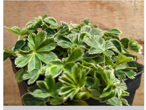
Lady's Mantle, Mini

A hardy evergreen perennial succulent. An intrugiung plant suitable for containers, rock gardens and walls. Produces flowers in the summer when the plant is mature. Low maintenance and drought tolerant.