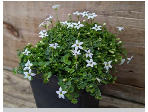
Star Carpet, Alpine White

This low-growing plant forms a clump of coppery-bronze leaves, remaining evergreen. Makes an unusual edging or rock garden plant especially in containers. Can also be planted next to a small pond or stream.