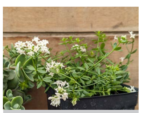
Woodruff, Tiny Sweet

Striking clumps of yellow-striped grass that provides wonderful color and texture for shaded gardens. An excellent groundcover and hardy plant for a water garden.