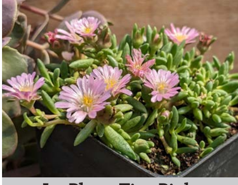
Ice Plant, Tiny Pink

A slow growing succulent plant that is naturally a low growing ground-cover. Has a tuberous base that can be exposed to make a bonsai tree. Small flowers with bright violet-pink petals appear in spring.