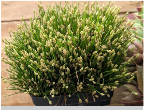
Fiber Optic Grass, Dwarf

This petite fern is a delightful addition to any collection. Fronds reach just a few inches in length making it the perfect size for small spaces. Prefers bright, indirect light and moderate humidity.