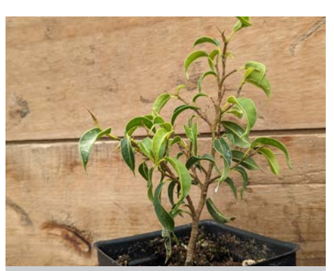
Ficus Mini Lucie

Curly ficus is one of the smallest members of the ficus family. Has vivid green heartshaped leaves with cream-colored mid-veins. Can be trained to climb trellis or topiary.