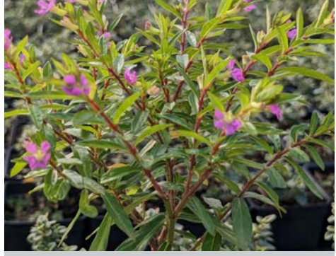
Elfin Herb, Assorted Colors

A columnar shaped evergreen with bright golden-yellow foliage. When crushed or brushed against, the needles smell strongly of lemons. An excellent container plant or color accent for your garden.