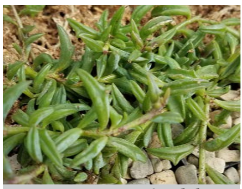
Senecio, String of Dolphins

A small low growing succulent, that roots along the stems to provide an easy care, groundcover for hillsides and yards. Powdery blue-green leaves all year around.