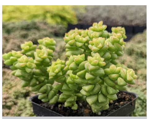
Jade, Tom Thumb

Its gorgeous compact rosettes consist of dark green leaves with black spots. Leaves turn reddish color in the summer as the white and pink flowers arrive.